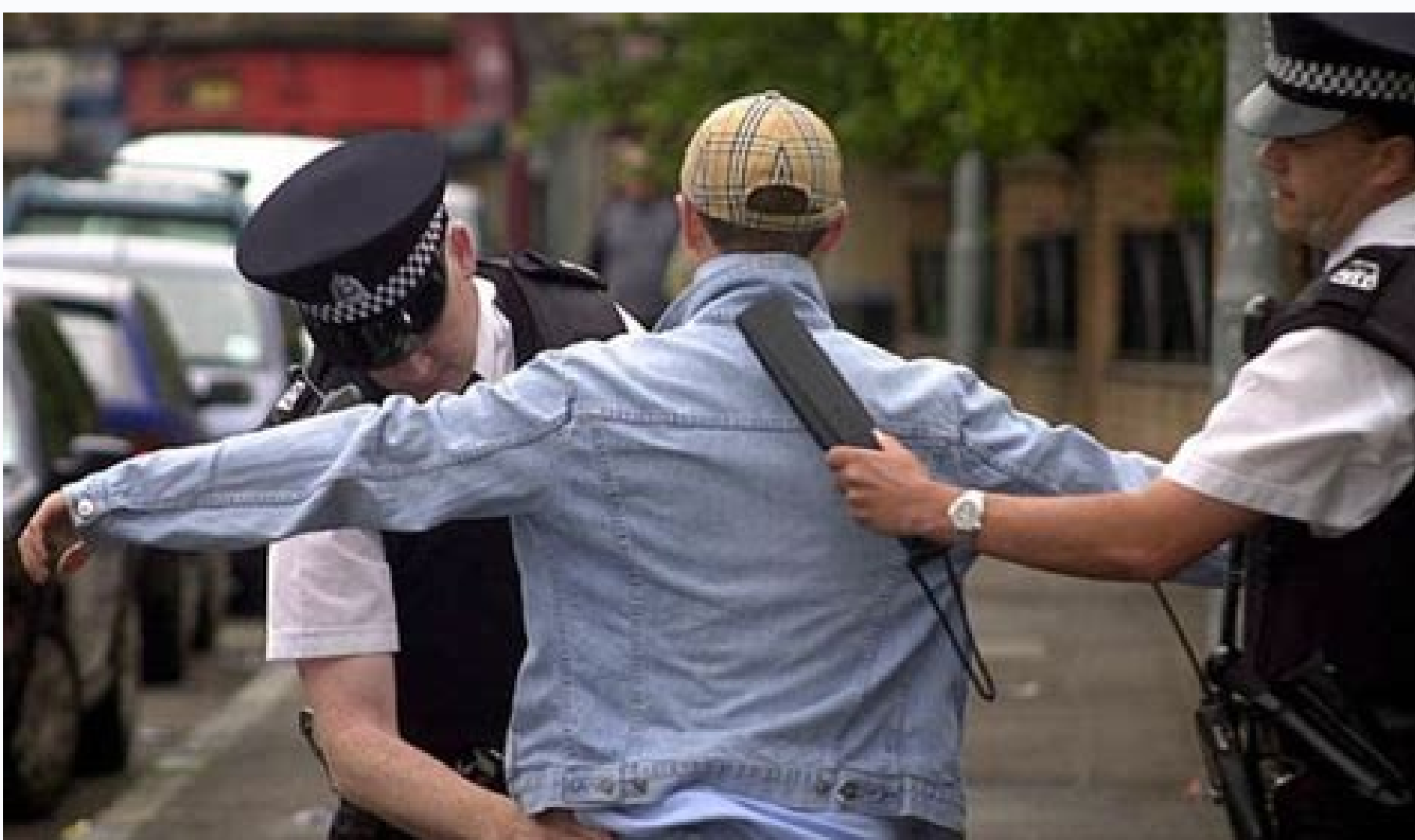
How to report antisocial behaviour to the police. How can i report anti social behaviour. Can you report anti social behaviour to the police.